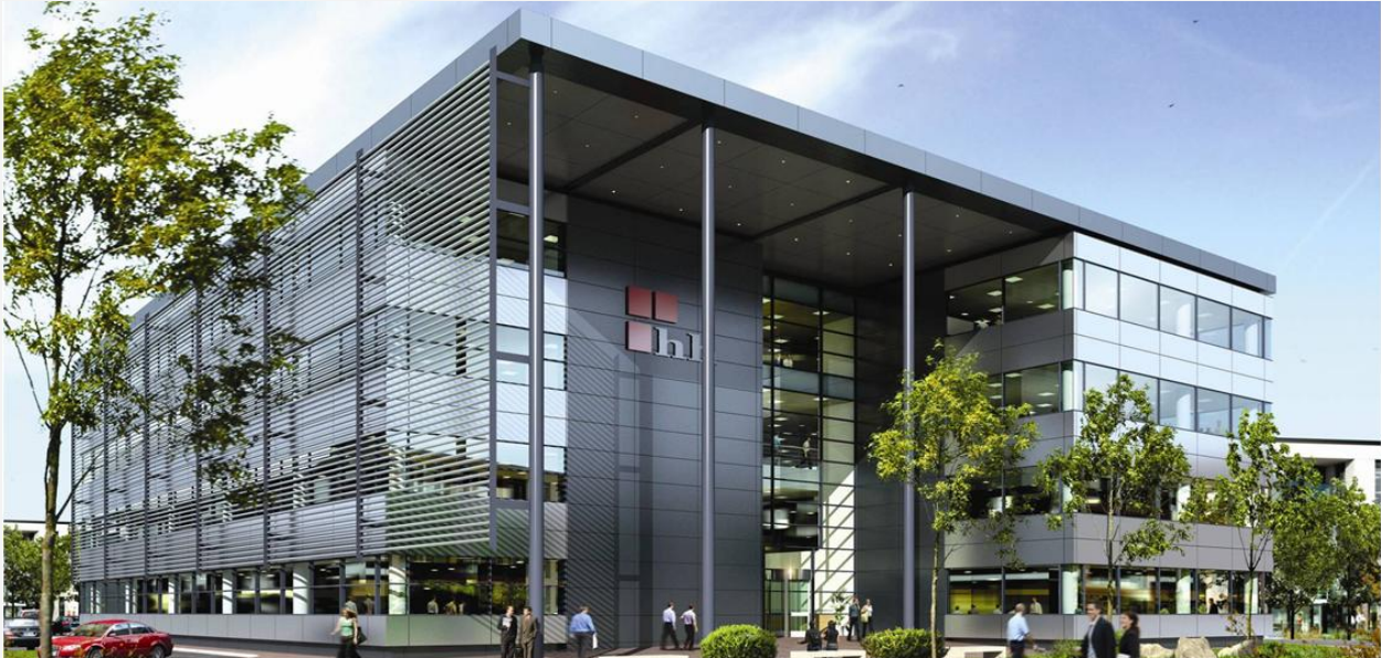
The Point -14 acre mixed use site