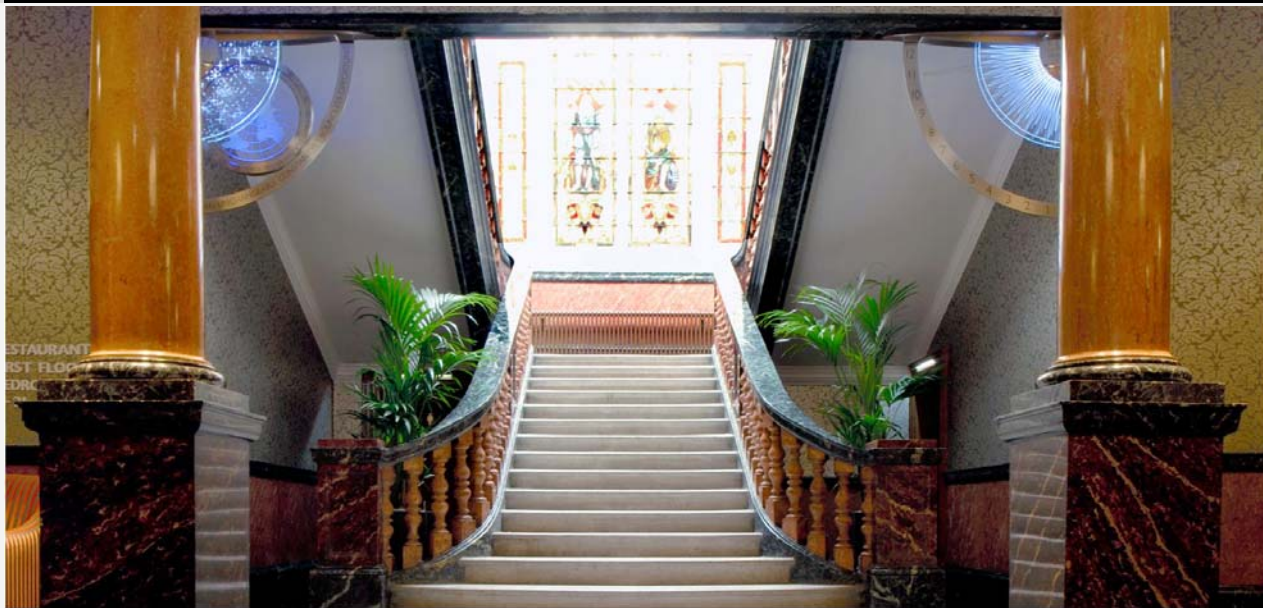
City centre boutique hotel