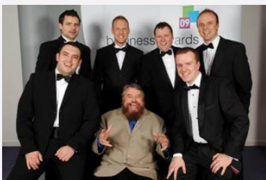
Orchid IT -Business of the Year

All three Marketing Derby Bondholders who were nominated - East Midlands Airport, Derby County Football Club and Orchid IT- are celebrating after scooping awards at the prestigious Business Derbyshire Awards, held at Pride Park Stadium on Friday night.