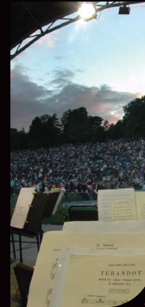
1_Donnington Grand Prix Circuit 2_Annual Derby Festé 3_Cathedral Quarter street cafe 4_Eating out in Friar Gate 5_UK's biggest classical concert