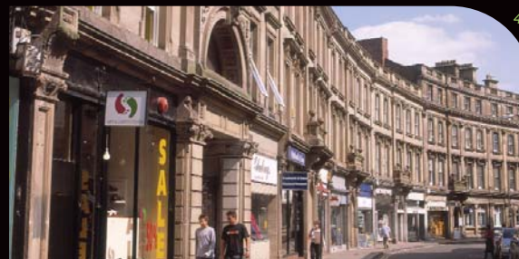
1_Friar Gate Restaurant Quarter 2_Cathedral Quarter 3_The Market Place 4_The Strand 5_Ferris Wheel, Market Place