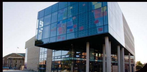
1_Derby Riverlights 2_Westfield, Derby 3_Cranes on the Skyline 4_Cathedral Quarter Pub 5_QUAD, Visual Arts and Media Centre.