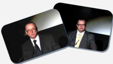
Leader and CEO of Derby City Council

Maintaining Derby's development momentum was the key message of the day. With over £1bn invested in the past 5 years the leader and CEO of Derby City Council highlighted their plans to continue this.