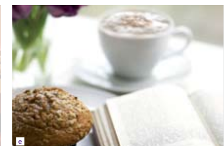
a. Hey Fish, Eat Central level 2, Westfield Derby. b. Pieminister, Eat Central level 2, Westfield Derby. c. Eat Central, Westfield Derby. d. Studio One, Showcase Cinema De Lux, Westfield Derby. e. A great choice of coffee shops.