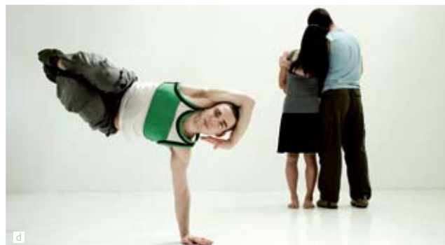
a. Derby's Market Place packed during Festé. b. Leading Jazz musicians perform throughout the city. c. Derby has three museum attractions for the kids. d. Déda is the East Midlands dance centre and offers a contemporary programme.