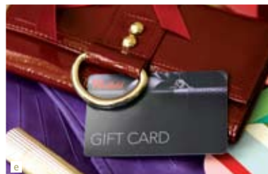
a. Malls at Westfield Derby. b. Pulp, level 1, Westfield Derby. c. Offering the best of the high street with over 60 great names in fashion. d. Lakeland, level 1, Westfield Derby. e. The Westfield Derby gift card.