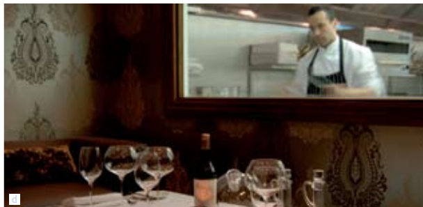
a. The bustling Standing Order in Iron Gate. b. Derby hosts over 100 eating-out venues – many based on the tree-lined Friar Gate. c. Masa Wine Bar and Restaurant located on Brook Street. d. The Chef's table at Opulence Restaurant, located in the Cathedral Quarter Hotel.