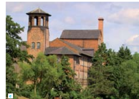
a. Cathedral Green. b. Contemporary stained glass window, Derby Cathedral. c. Royal Crown Derby visitor centre. d. An artists impression of the new bus station that will be part of the Riverlights complex. e. Derby Silk Mill, part of a UNESCO World Heritage Site.