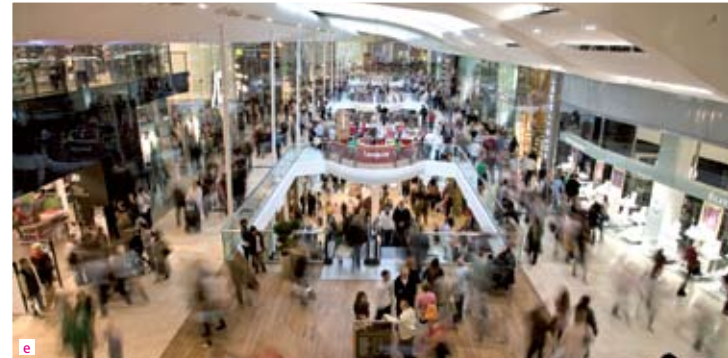
a. The Saruga Dragons from Barcelona, part of Derby's annual Festé. b. QUAD – Derby's contemporary arts, media centre and cinema. c. In the Strand Arcade. d. Darley Park Concert, the UK's biggest free outdoor classical concert. e. Westfield Derby - voted a top ten UK shopping centre.