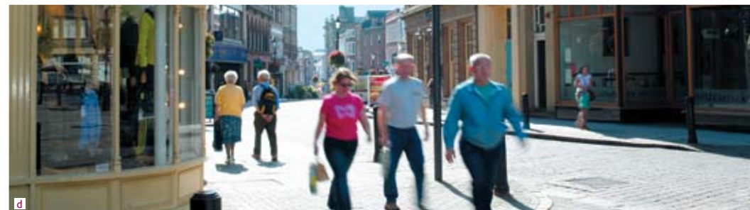
a. Derby's elegant 16th Century Cathedral. b. Shopping in Sadler Gate. c. Derby's Victorian Market Hall. d. Quality shopping on Iron Gate.